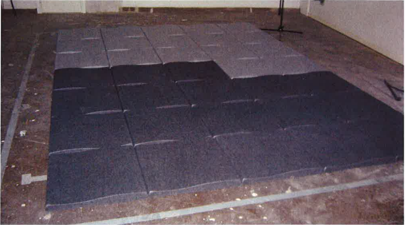
Wall panels mounted on the floor of the reverberation room.

The specimen was mounted on the floor of the reverberation room in conformance with ISO 354:2003 Annex B. The specimen pieces were mounted so that a single row creates a waveform.